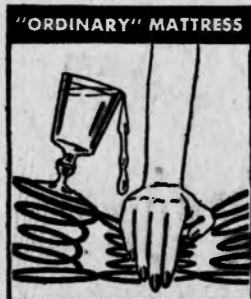
Ordinary Mattress: Coils wired together. Press one, others sag!

THE ONLY MATTRESS WITH FLOATING ACTION COILS