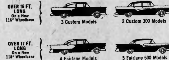
OVER 16 FT. LONG On a New 116" Wheelbase