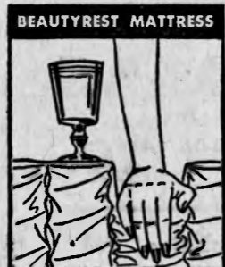
Beautyrest Mattress: Coils are individually pocketed, can't sag!