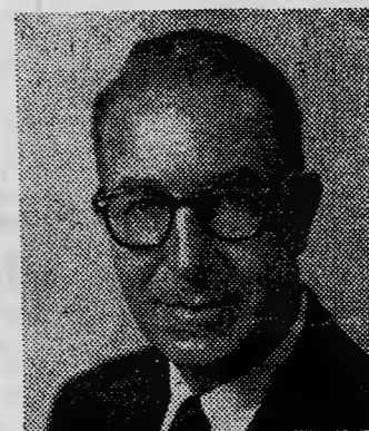
For Vice President Estes Kefauver