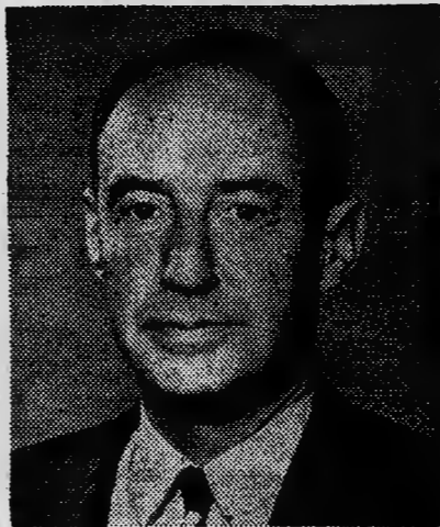
For President: Adlai E. Stevenson