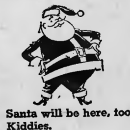
Santa will be here, too, Kiddies.