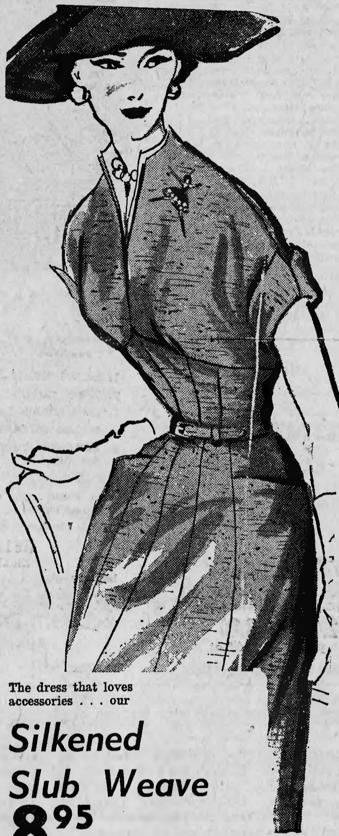
The dress that loves accessories... our

If it's Style...if it's Quality... you'll find it at Penney's for less!