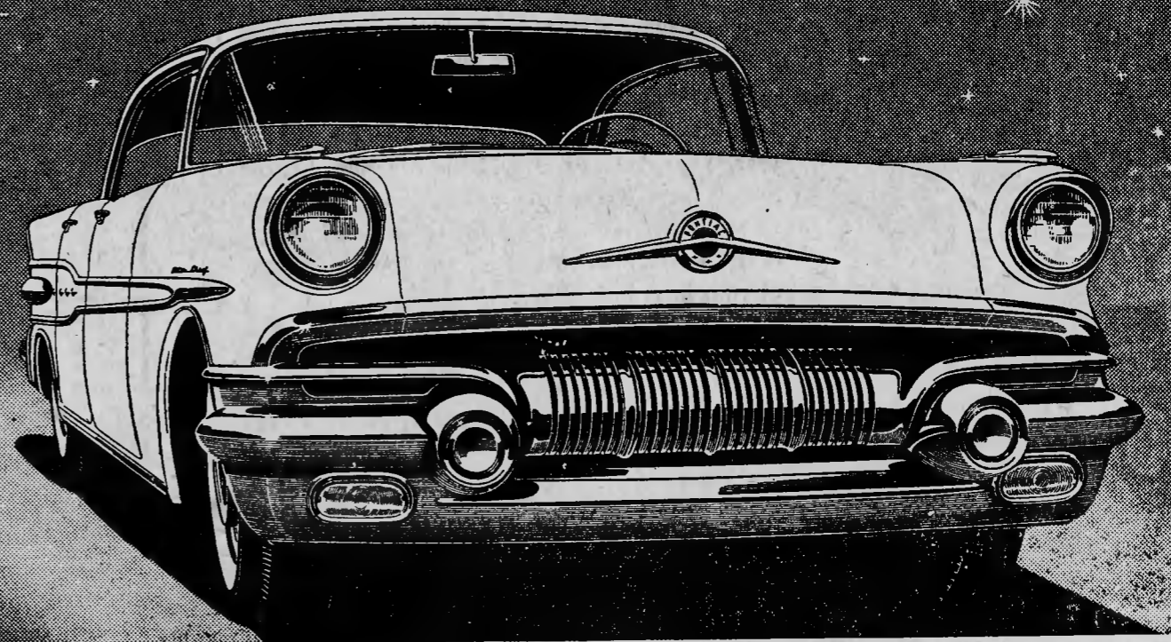
*DAYTONA GRAND NATIONAL CHAMP! A stock 317-h.p. Pontiac with Tri-Power Carburetion—extra-cost option on any model—beat all competing cars regardless of size, power or price in the biggest stock car competition of the year!