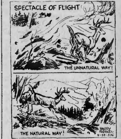
Forest fires destroy wildlife! Be careful, please!