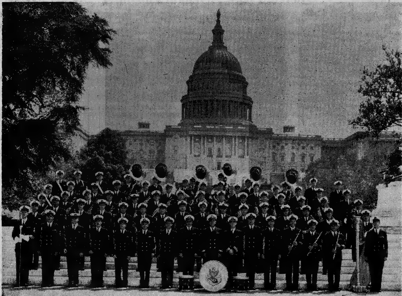
THE UNITED STATES NAVY BAND, COMMANDER CHARLES BRENDLER, CONDUCTOR