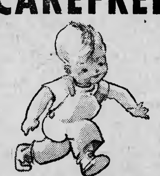
BECAUSE HE'S WEARING