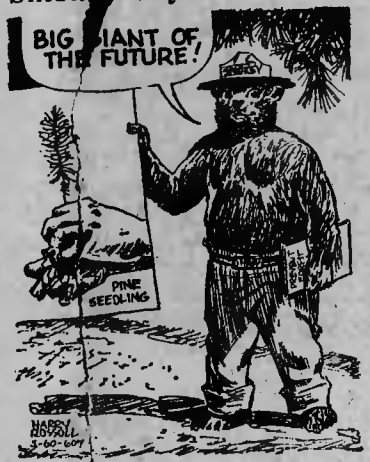
Fire destroys young trees, the future forest!

BE SURE YOU'LL BE A HOME... COME BACK TO!