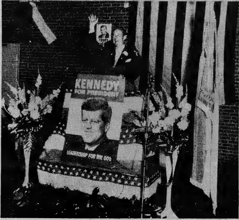
AT DEMOCRATIC RALLY — Adlai Stevenson, tanned and vigorous, beams and waves as hundreds of persons cheer him at the Democratic rally held Saturday in the school gymnasium.