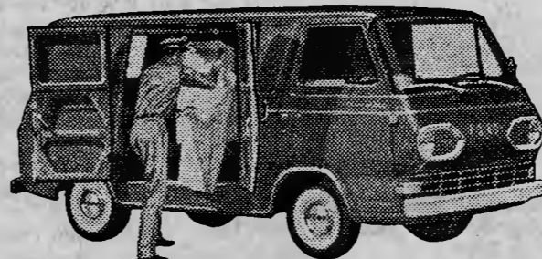
America's best selling van—and small wonder! Priced far under popular conventional 6½-ft. panels but has larger loadspace (204 cu. ft.)! It can save $100 a year on gas, oil, tires.