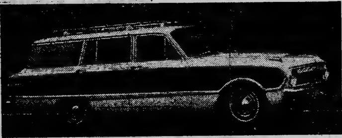
models in the Galaxie line, featuring a fresh approach to Ford's classic styling. Below is the Falcon Squire, a new addition to the Falcon line for