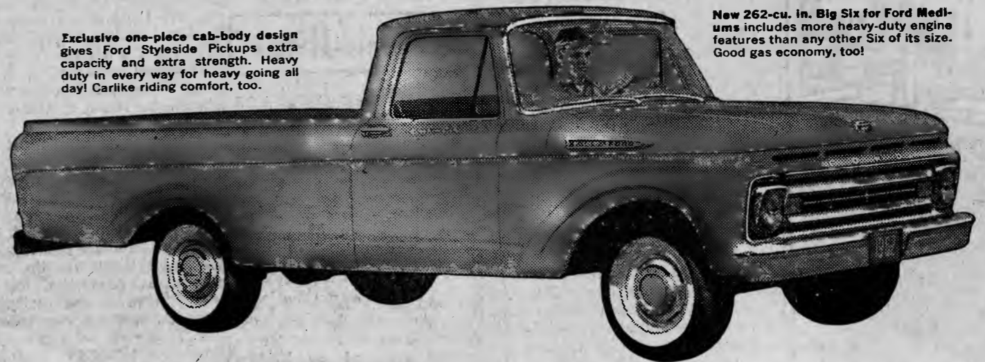
Exclusive one-piece cab-body design gives Ford Styleside Pickups extra capacity and extra strength. Heavy duty in every way for heavy going all day! Carlisle riding comfort, too.