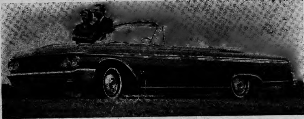
IN FORD LINE— Two of the models in the 1962 Ford line are pictured here. Above is the Ford Galaxie 500 Sunliner convertible, one of 12