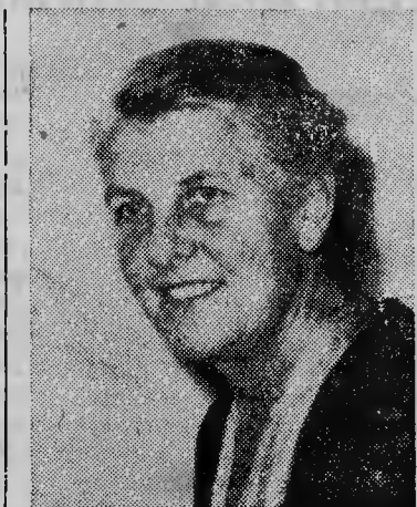
BARONESS VON TRAPP