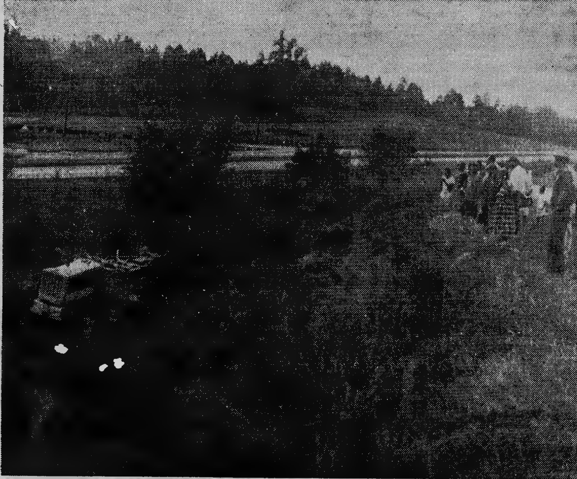
ACCIDENT SCENE—The motor grader that left the road and overturned, killing Buster Monroe of West Southern Pines, is seen at left at bottom of the embankment down which it rolled. Bystanders watch, at right. The camera was faced south on No. 1 highway parkway.

VOL. 41—NO. 46 TWENTY PAGES SOUTHERN PINES, N. C., THURSDAY, OCTOBER 5, 1961 TWENTY PAGES PRICE TEN CENTS