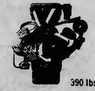
409 V8 252 hp; 390 lbs.-ft torque

NEW CHEVROLET-GM DIESEL DURABILITY Here's new earning power for middleweights... rock-bottom maintenance costs, compact size, low weight, top torque and top power.