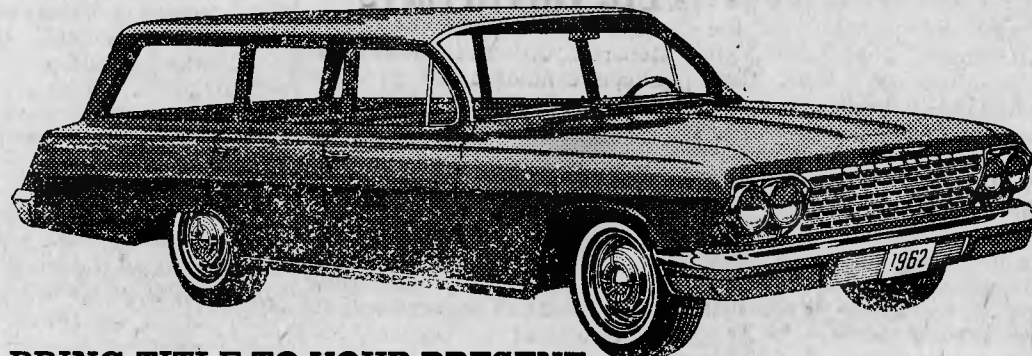
This Handsome 4 - Door Station Wagon is the perfect gift for the family-bitten by the station wagon fever!

BRING TITLE TO YOUR PRESENT CAR FOR AN ON-THE-SPOT DEAL