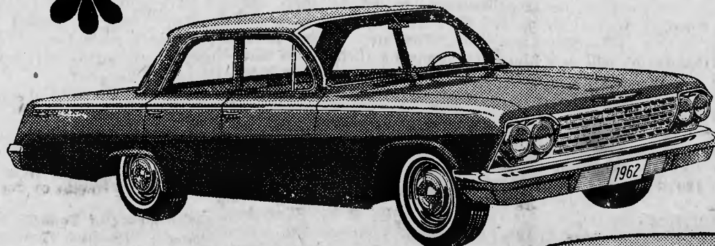
This Gorgeous Bel-Air Chevrolet would make a Christmas-Gift-Of-A-Lifetime.

IS ALL WRAPPED UP AND WAITING FOR YOU AT PINEHURST GARAGE