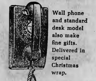
Wall phone and standard desk model also make fine gifts. Delivered in special Christmas wrap.