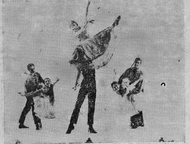
DANCE DRAMA GROUP