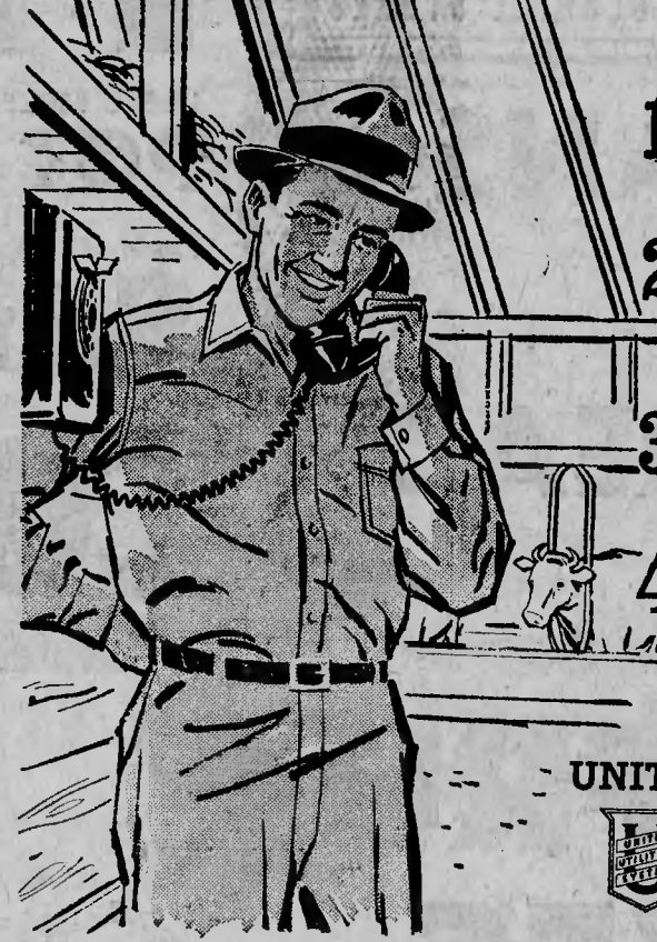
Figure It Yourself, Mr. Farmer...