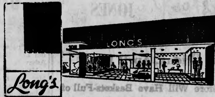
OPPOSITE COURTHOUSE ROCKINGHAM, N. C.

Hart Schaffner & Marx stock in Regulars, Shorts, Longs, Extra Longs and Portly.