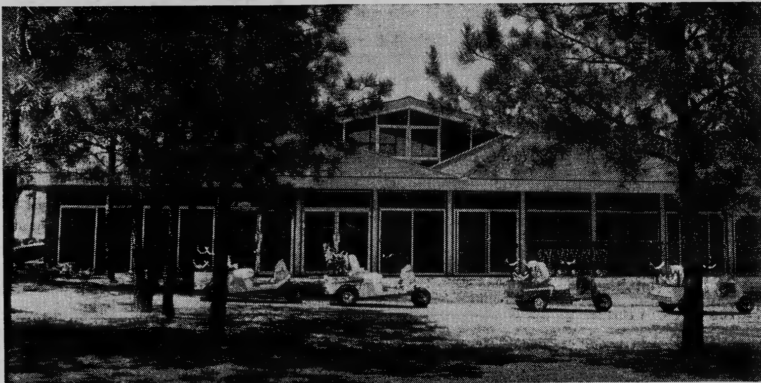
NEW CLUBHOUSE —The recently completed Whispering Pines clubhouse, overlooking the first hole of a nine-hole golf course that is rapidly being extended into an 18-hole layout—with plans for 36 holes eventually—is pictured with golf carts ready for players who have been enjoying the course for several

Membership in the Country Club is open to Whispering Pines property owners, but the course is open to the public on a greens fee basis.