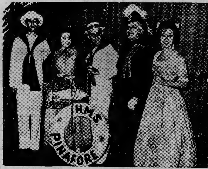
GILBERT & SULLIVAN ENSEMBLE