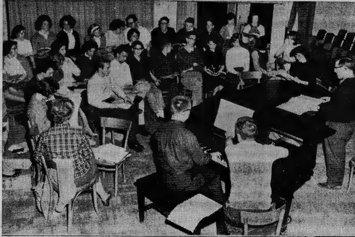
"BRIGADOON" REHEARSAL— Here's an overall view of the large cast that is busily rehearsing a production of "Brigadoon," the Broadway musical to be presented in Weaver Auditorium here Friday and Saturday, March 20 and 21. Rehearsals are taking place in the auditorium each Tuesday evening. Both adults and high school students are in the cast.

The VA has paid nearly $230-million in dividends for 1964 to more than 4.7 million veterans and servicemen who hold participating GI insurance.