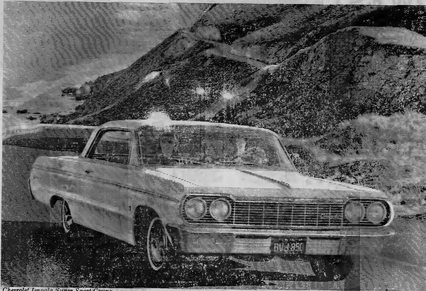
Chevrolet Impala Super Sport Coupe

It's Trade 'N' Travel Time at your Chevrolet dealer's—the perfect time to try the Jet-smooth ride. Find the meanest stretch of road you can. Then see for yourself how straight a crooked road can feel.