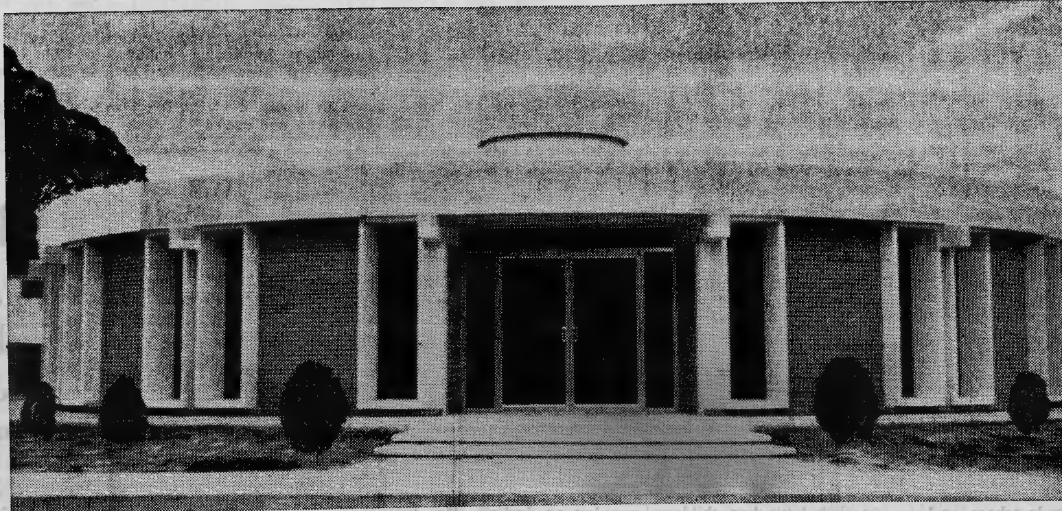
Main Lobby Banking Hours will remain the same.

Please note that we have established NEW BANKING HOURS for the convenience of our customers