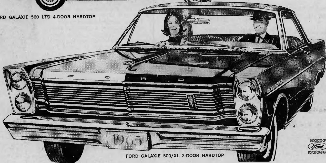
FORD GALAXIE 500/XL 2-DOOR HARDTOP

Test drive Total Performance '65... BEST YEAR YET TO GO FORD