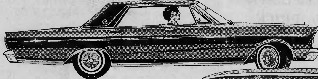
FORD GALAXIE 500 LTD 4-DOOR HARDTOP

5 new Ford Wagons—including Country Squires and Country Sedans with new dual facing rear seats, ideal for families up to 10. See all the new models from Ford at your Ford Dealer's soon!