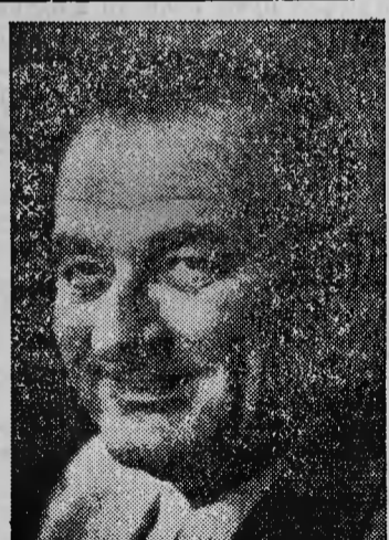
LYNDON JOHNSON For President

Don't Be Half Safe! Be Safe All the Way! Vote straight Democratic ticket!