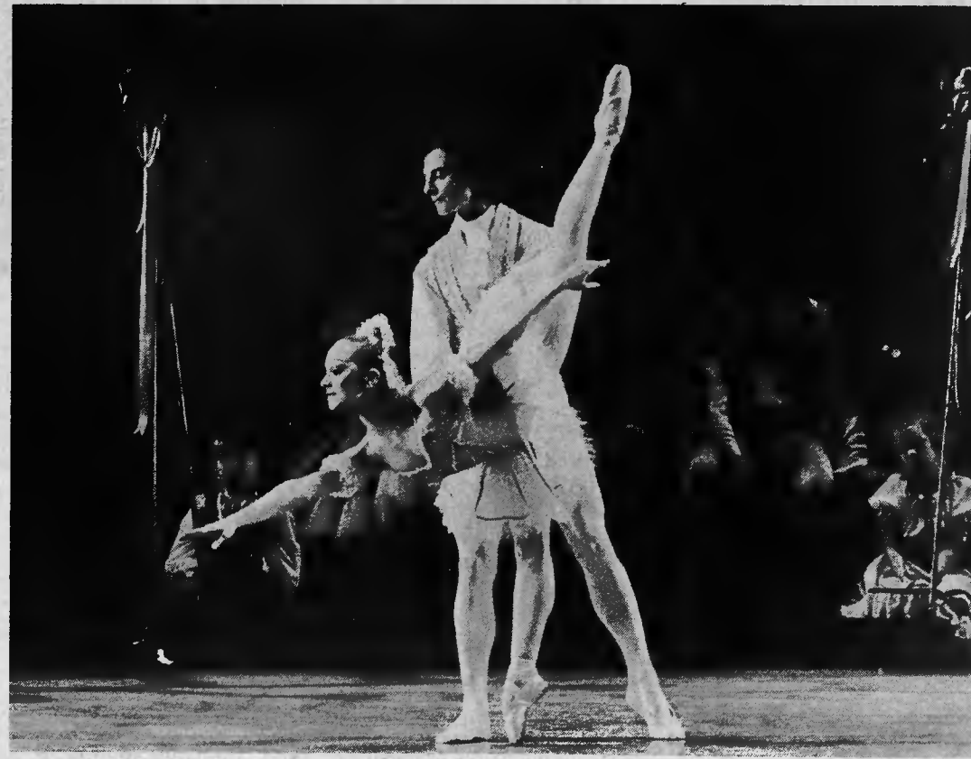
NC Dance Theater Members in 'The Nutcracker'

Madrigal Dinner On Friday, December 8, the Moore County Schools music and cultural arts faculty and students will present a traditional