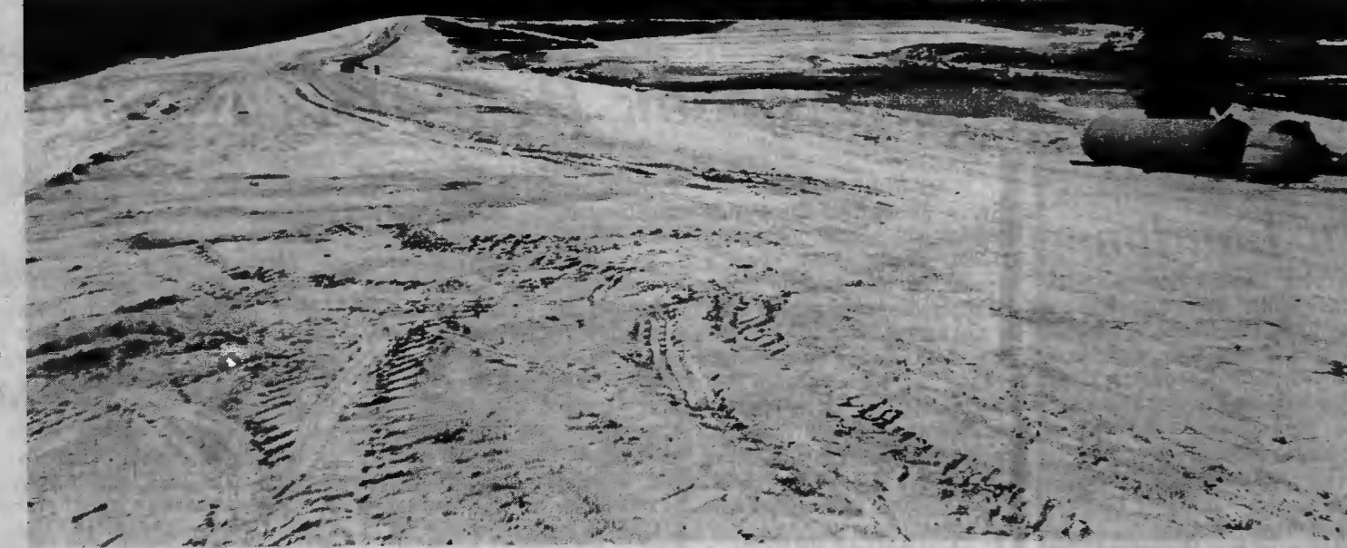
LAKE AUMAN DAM — Work is progressing on the $3 million dam at Seven Lakes West which will create the 1,000 acre Lake Auman, named in honor of former Rep. T. Clyde Auman. One of the largest earth dams in the Eastern U.S., it is expected to be completed in late 1982. It will be more than 600 feet thick at its base, 2,100 feet wide and 92 feet high.

Little added that the Richmond and Moore chapters of the (Continued on Page 14-A)