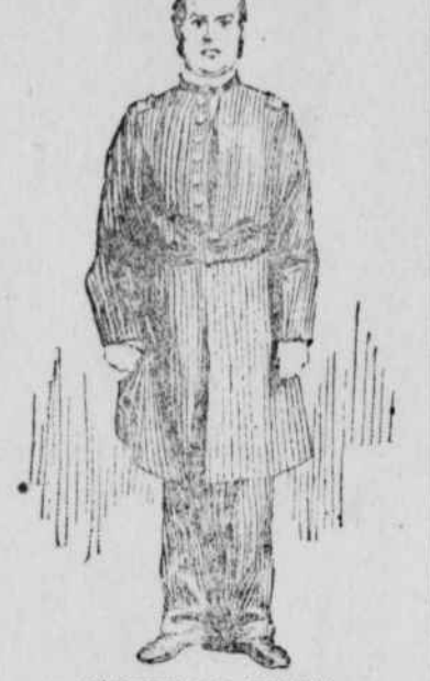
M'KINLEY AS A SOLDIER.

Poland had strong enlisting propensities. It was the banner township. The boys went to the front just as soon as the national government would take them. Poland's pride today is that