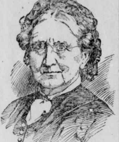
MOTHER OF PRESIDENT M'KINLEY.

The United States never struck a blow except for civilization and never struck its colors. Has the pyramid lost any of its strength? Has the