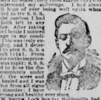
table blood purifier known. $1,000 is offered for proof that it contains a particle of 200 mercury, potash or other mineral poison. Send for our free book on Blood Poison ; contains valuable information about this disease, with full directions for self treatment. ' We charge nothing for medical advice ; cure yourself at home. THE SWIFT SPECIFIC CO., ATLANTA, GA.

Bave Been No Worse. eir trea me no good ; I was get