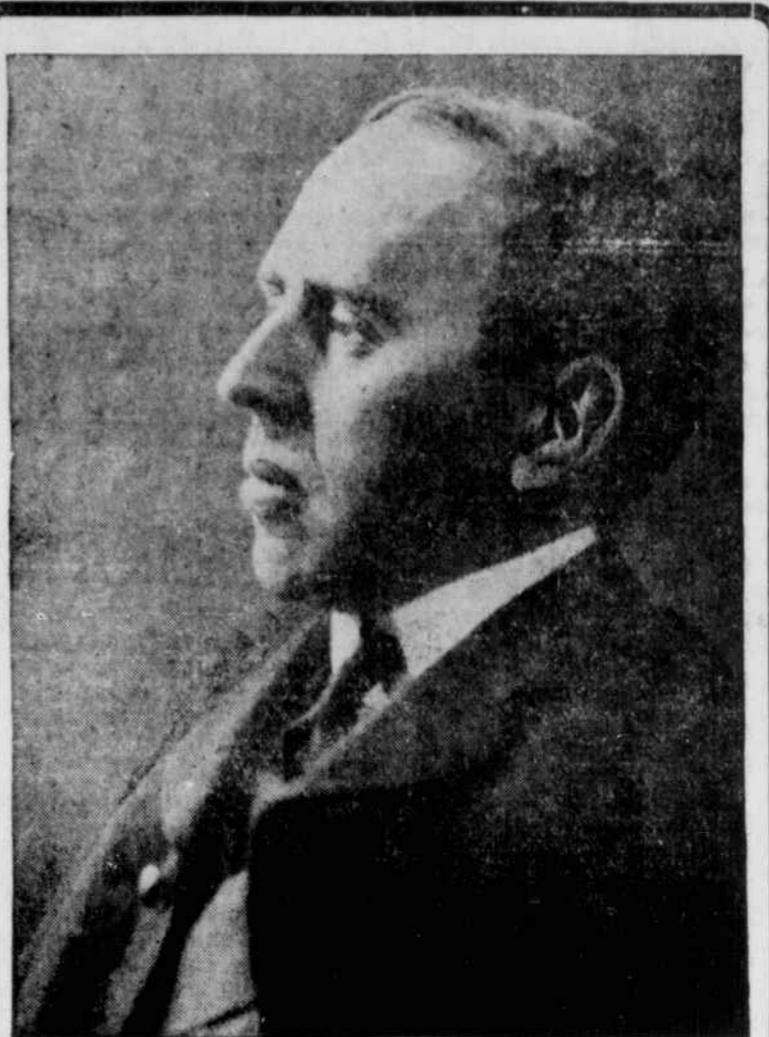
GEORGE BARR McCUTCHEON AUTHOR OF