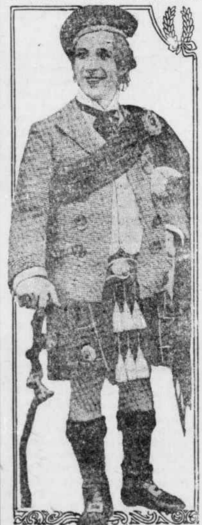
HARRY LAUDER IN CHARACTER.

A very delicate question of veracity has arisen between Harry Lauder, the Scotch comedian, and his manager over the stipend Harry is to receive during his coming engagement in America. Harry's manager without the slightest resort to concealment or evasion declares that he has engaged Lauder to sing and act at the princely wage of $5,000 per week. Harry modestly denies the allegation, says the sum named is absurdly high and even