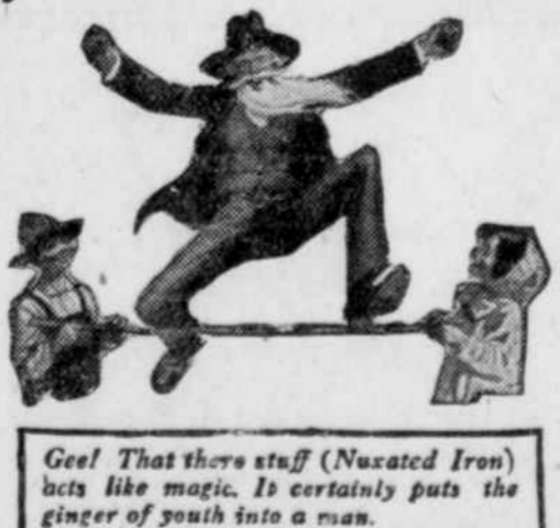
Get That stuff (Nuxated Iron) acts like magic. It certainly puts the ginger of youth into a man.

"Iron is absolutely necessary to enable your blood to change food into living tissue. Without it, no matter how much or what you eat, your food merely passes through you without doing you any good. Next take two five-grain tablets of Nuxated Iron three times per day after meals for two weeks. Then test your strength again and see how much you have gained. From my own