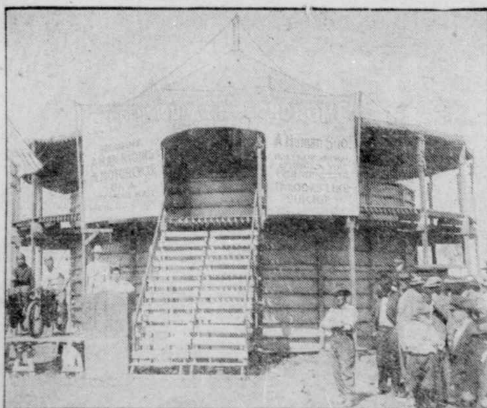
One of the Big Attractions

The big Show will arrive here Sunday over the Coast Line Railroad on their own all-steel special train of 25 cars.