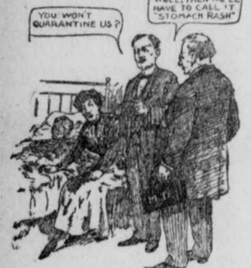
"HARD TO SAY, NO."

If it is a Quarantinable Disease Don't Ask Your Doctor to Call It Something Else to Avoid Quarantine. There are selfish people in every community who care nothing for the welfare or safety of their neighbors and stop at nothing to evade the law governing the isolation of contagious disease. Such people will appeal to the doctor to make an exception in their case, in order to avoid injury to their business or something like that. If the doctor is square and honest he will do his duty and refuse to be a party to fraud. If he is crooked he may give in to the pleadings of the family and consent to the conspiracy against public welfare. Such a physician merits a severe penalty. He is a traitor to