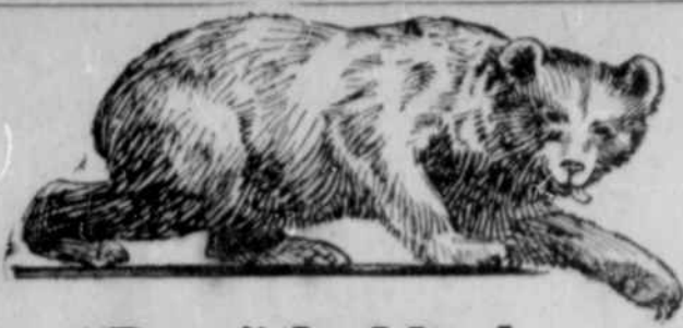
"Bear" In Mind

Dreco is sold throughout the country by leading druggists and is particularly recommended in Smithfield by Creech Drug Co.—Adv.