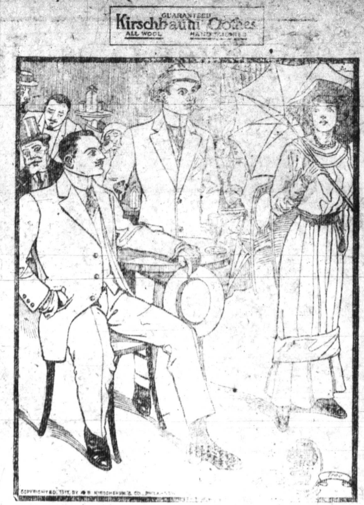
From the reproduction in oil of the Cafe de la Paix, on the Boulevard des Capucines, Paris. The Kirschbaum Spring and Summer models on the male figures in the foreground (reading from left to right) are the Strand and West End.