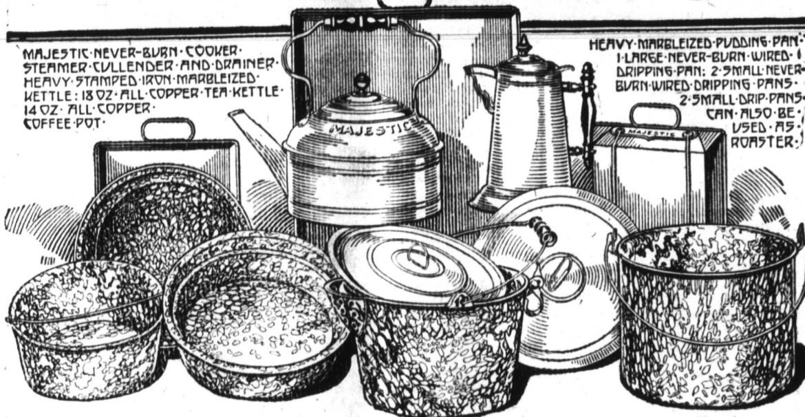
MAJESTIC NEVER-BURN-COOKER-STEAMER-CULLENDER AND DRAINER-HEAVY STAMPED IRON-MARBLEIZED KETTLE-18 OZ. ALL-COPPER-TEA KETTLE-14 OZ. ALL-COPPER-COFFEE-POT

EDUCATION lies in KNOWING THINGS—KNOW why the oven of a range is heated—KNOW how the water is heated—HOW the top is heated—WHY the MAJESTIC uses so little fuel—KNOW how a range is made inside and outside. This education may serve you in the future. DON'T OVERLOOK a chance to KNOW THINGS shown by one who knows. COME.