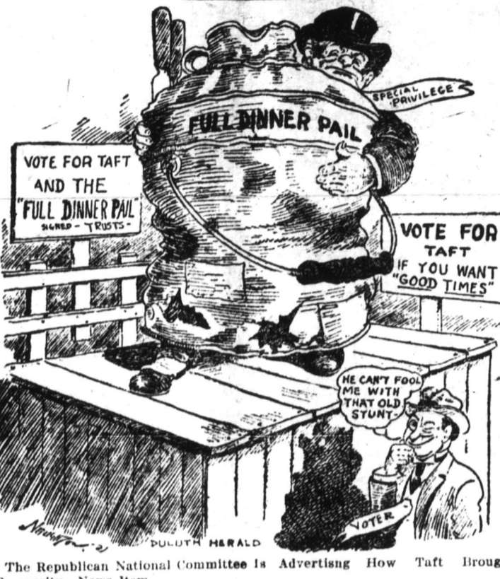
The Republican National Committee is Advertising How Taft Brought Prosperity—News Item.