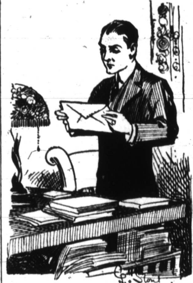
He Had Suddenly Remembered That It Was His Twenty-fifth Birthday.

To the general public which read its daily newspaper perhaps none of the gilded set was better known than "Vanity Vallant." The new Panhard he drove was the smartest car on the avenue, and the collar on the white bulldog that pranced or dozed on its leather seat sported a diamond buckle. To the spacewriters of the social columns, he had been a perennial inspiration. The patterns of his waistcoats, and the splendors of his latest bachelors' dinner at Sherry's—with such