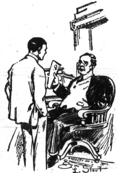
"It's Very Good Living Abroad. There's a Boat Leaving Tomorrow."

For the first time the young man noted that the street below was filling with a desultory crowd. He distinguished a knot of Italian laborers talking with excited gesticulations—