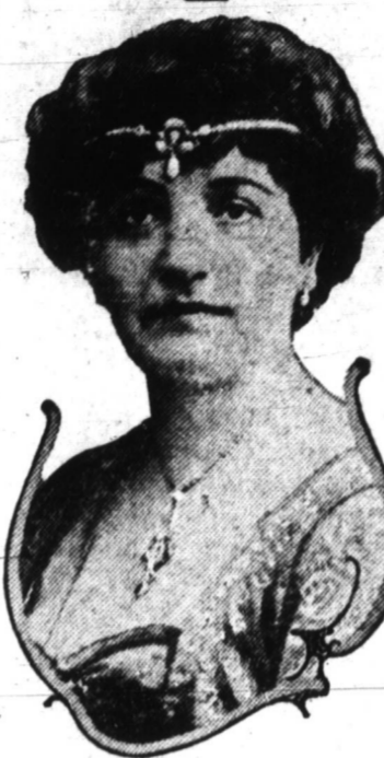
This is a new photograph of Mme. Poincare, wife of the president of the French republic. It is reported that she is expecting a visit from the stork in the near future. Mme. Poincare is forty-six years old, and has no children.