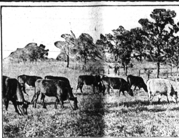
Beef Cattle Grazing in Virginia.

(Prepared by the United States Department of Agriculture.)