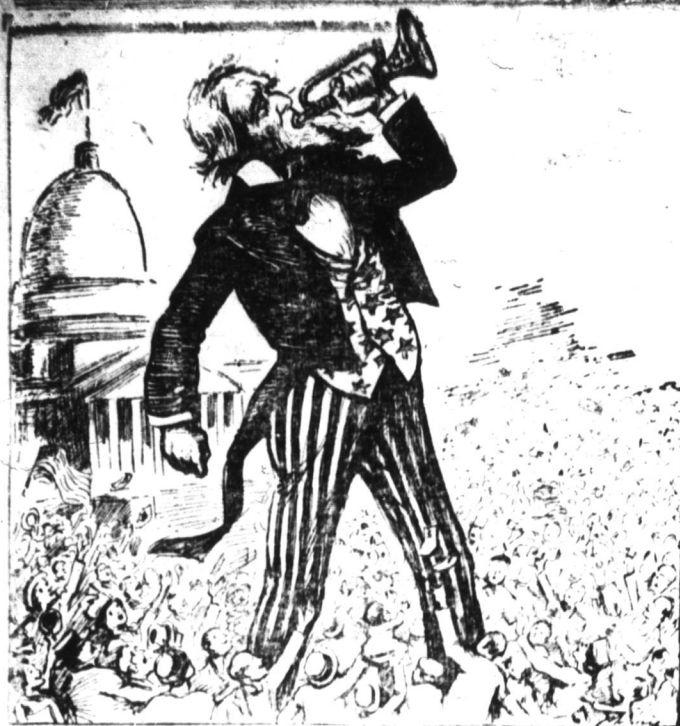
"May there be none unenlisted"—Woodrow Wilson