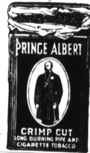
Prince Albert is sold in tippy red tugs, tidy red tins, handsome pound and half pound tin humidors and in the pound crystal glass humidors with sponge moisture top.

Ever roll up a cigarette with Prince Albert? Man, man—but you've got a party coming your way! Talk about a cigarette smoke; we tell you it's a peach!