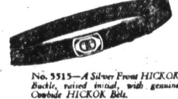
No. 5515—A Silver Front HICKOK Buckle, raised initial, with genuine Cowhide HICKOK Belt.