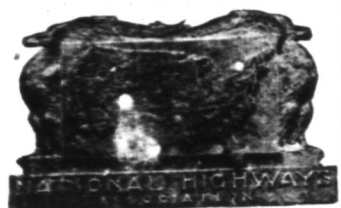
NEWSPAPER ASSOCIATION MEMBER NO. 3967

Entered at the Post Office at Williamston, North Carolina as second class matter.