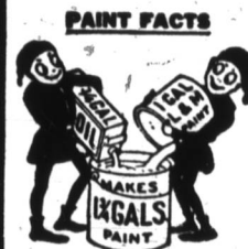
Illustration describes how easy it's done by making