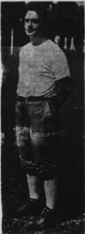
The gentleman pictured above is Jim Crowley, head coach of the famous Fordham football team, who will bring his celebrated Rams to Chapel Hill Saturday on their first Southern invasion. Coach Crowley was one of the Four Horsemen of Rockne's famous national championship 1924 team.