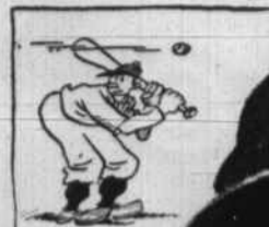
ONLY FIVE FEET, SIX, HE IS ONE OF THE SMALLEST MEN IN THE BIG LEAGUES