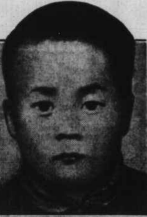
Here is the plump peasant boy of six, whose name is Lingerh Lamantchu, enthroned as the fourteenth Dalai Lama, spiritual and temporal leader of Tibet, at Lhasa. The boy is said to have been born at exact moment the thirteenth Dalai Lama died, Dec. 17, 1933, bearing out theory of reincarnation. Until the boy is 18, the country will be ruled by a regent.