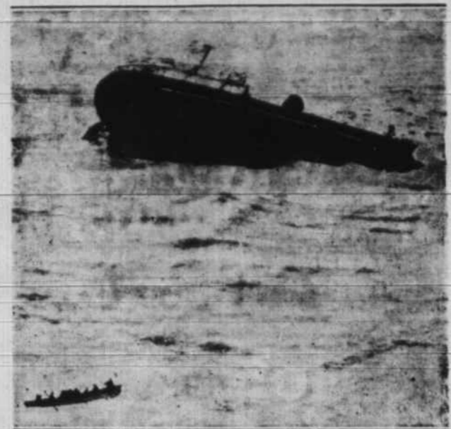
A neutral ship (name and nationality withheld by British censors) is shown going down to Davey Jones' locker off the Thomas estuary, England, after striking a mine. The ship's lifeboat is at lower left, pulling away from the doomed craft. Photo made by a pilot of the British Royal Air Force, who summoned naval help.