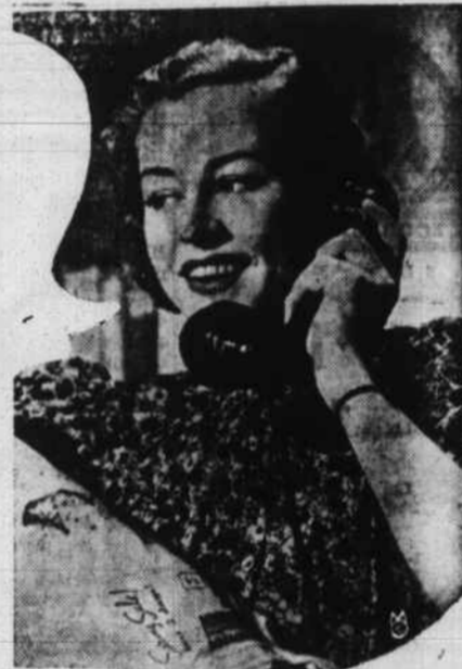
MISS TEXACO They All Call For Texaco

Call Us for the Best Nos. 1 and 2 Fuel Oil for Homes, Farm Use and All Purposes